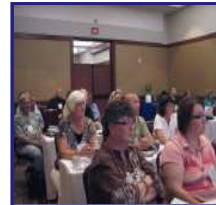
Participants listen during a presentation at the KPTA Conference