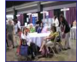
Members listen for their name to be drawn at the expo.