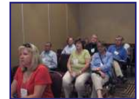
During the presentations at the KPTA Conference.