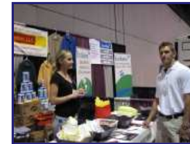
Visiting vendors during the expo.