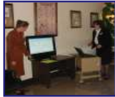
Adair & Bourne

to tie it all together for multiple rural transportation systems.